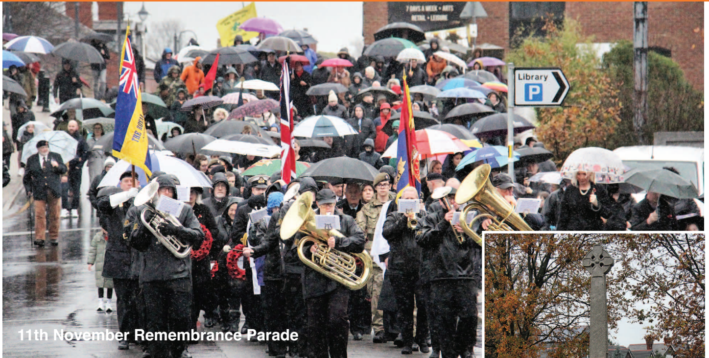
11th November Remembrance Parade

Every year in November, the Poppy Appeal prompts us all to remember and honour the brave men and women who have sacrificed so much in service to our country – and the many who still do. Their courage, faith and devotion inspire us daily, as demonstrated by the great attendance at the recent Remembrance events in Burscough (despite the weather!).