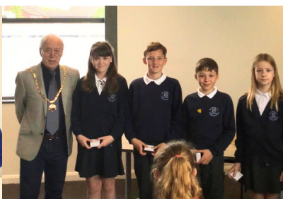
Pupils from St. John's C of E