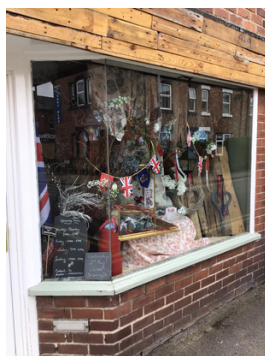
The Three Pence Sea Thrift display

We are incredibly proud of our Town and the talented businesses that showcased their creativity and adorned our streets with regal magnificence.