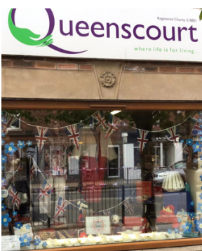
Queenscourt Hospice window display