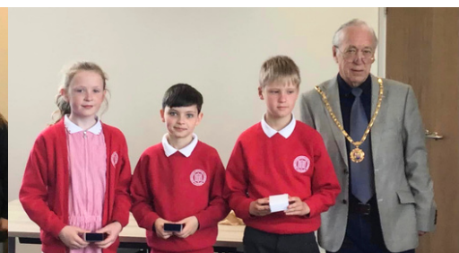
Pupils from Lordsgate Township C of E