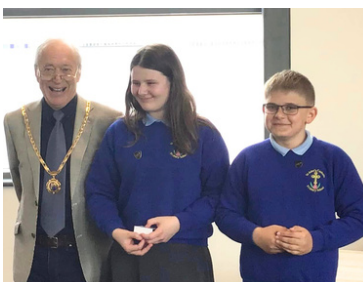
Pupils from St. John's Catholic Primary

To find out more about our new building, see the article on page X 'All Change at the Interchange'.