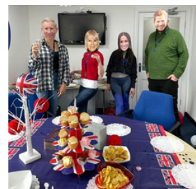
Face for Business

The winner was Three Pence Sea Thrift on Mart Lane, a new business in our Town Centre, which was presented with a cheque for £200 with the runner-up, Queenscourt Hospice Shop, getting a cheque for £50. Thank you for your participation and for making this event a great success.